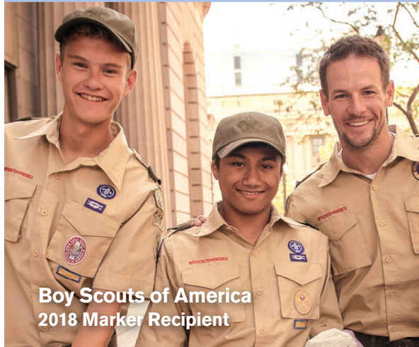
Boy Scouts of America 2018 Marker Recipient